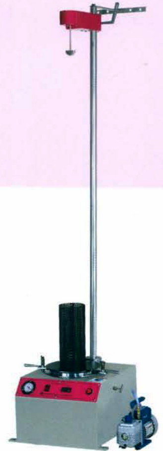
Dart Impact Tester