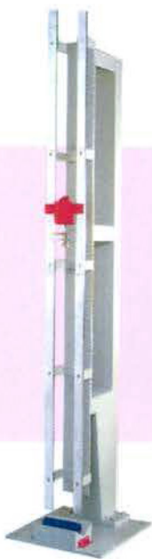
Impact Tester for Pipes