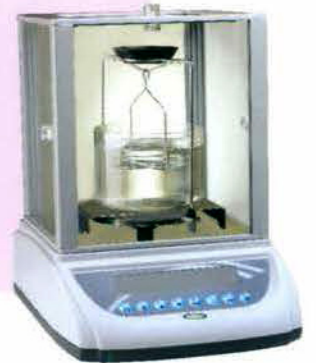
Digital Density Apparatus