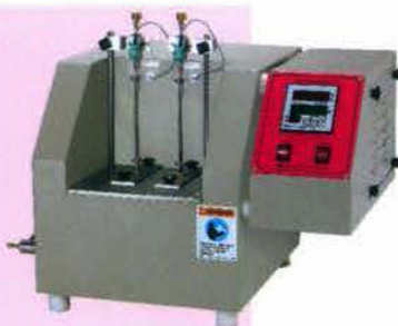
Computerized VSP/HDT Apparatus (2 Stations)