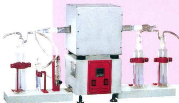
Carbon Content Apparatus