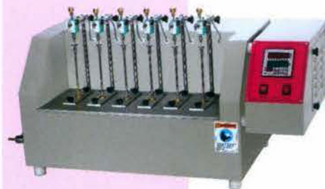
Computerized VSP/HDT Apparatus (6 Stations)