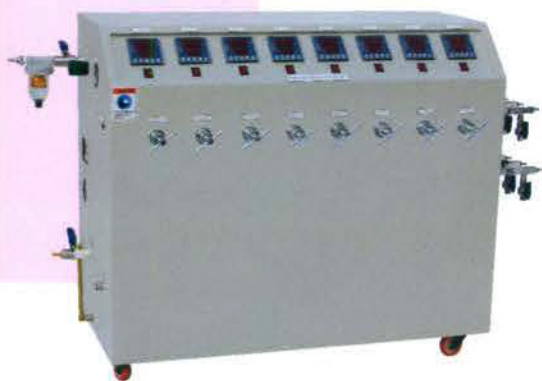
Hydrostatic Pressure Test Panel