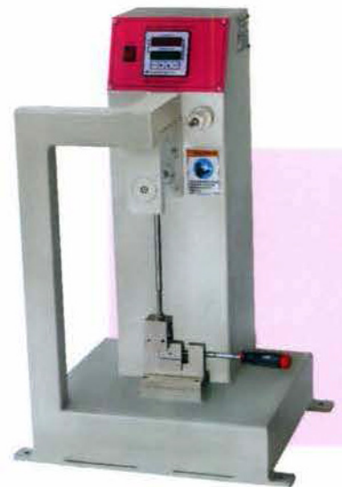
Computerized Izod/ Charpy Impact Tester