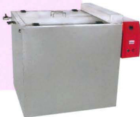
Bath for Hydrostatic Pressure Test Panel