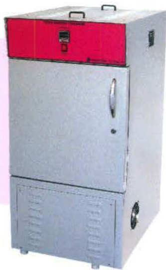
Zero Degree Chamber