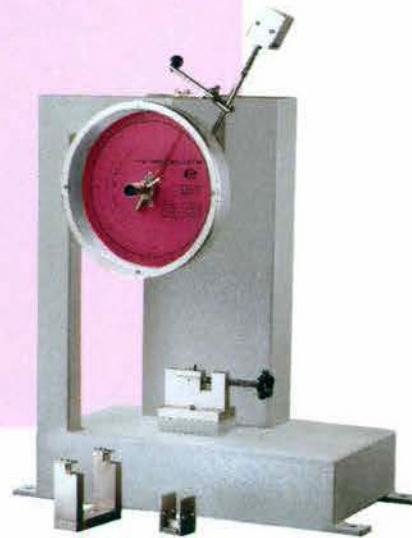
Analogue Izod / Charpy Impact Tester