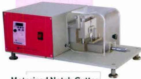
Motorized Notch Cutter (Variable Speed)