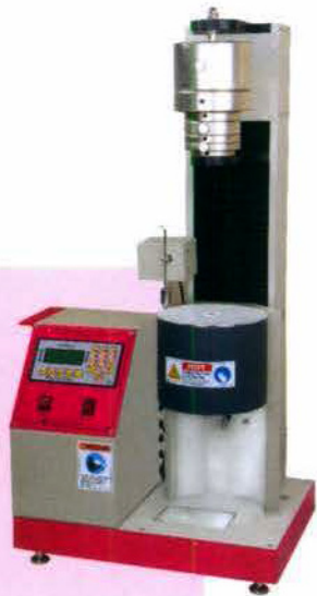
Melt Flow Index Tester Computerized-Method A & B