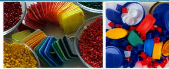
Melt Flow Index Tester Computerized - Method A