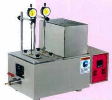
Analogue VSP/HDT Apparatus