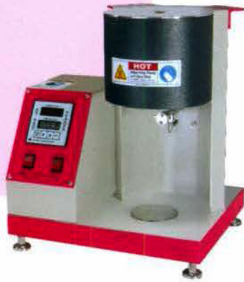
Melt Flow Index Tester (KAYJAY/2006/AC)