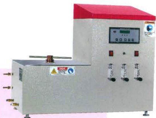
Oxidation Induction Test Apparatus