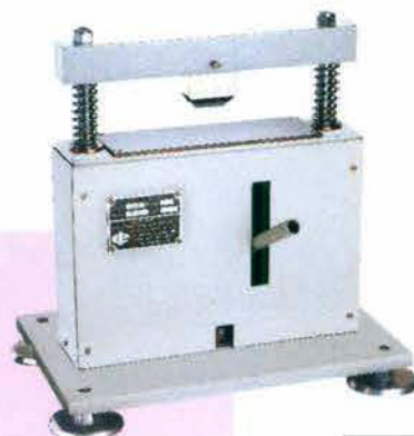
Manually Operated Hydraulic Press & Die