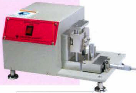
Motorized Notch Cutter (Fixed Speed)