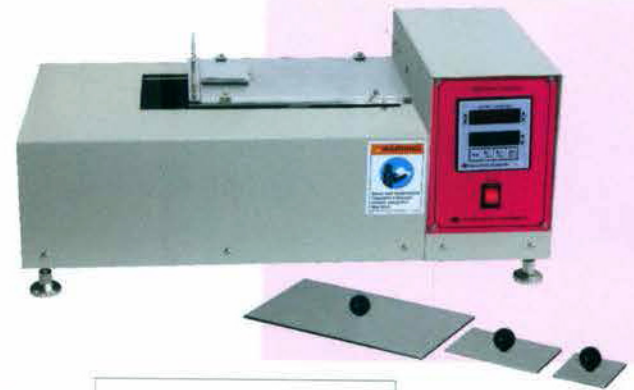
Computerized Co-efficient of Friction Tester