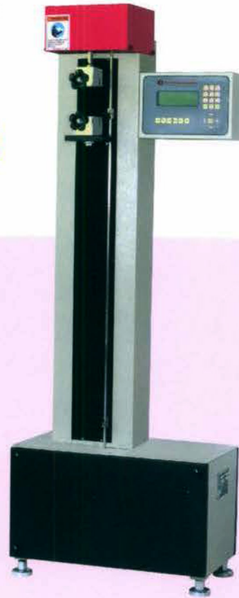
Single Screw Tensile Tester