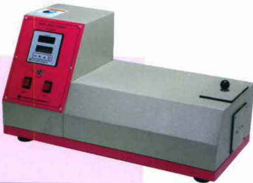
Digital Opacity Tester