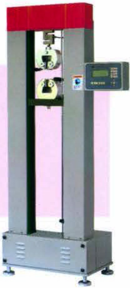
UTM - Servo Controlled