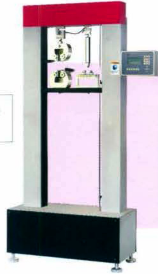
UTM - Vector Controlled